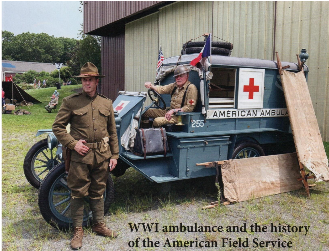
WWI ambulance and the history of the American Field Service

As you know, the Elks were the first to supply ambulances to our troops in Europe during “The Great War to End All Wars”. The vehicle pictured above is what an actual field ambulance looked like. We still serve our Troops in whatever land they are deployed and at home as well.