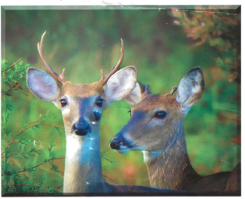
Frank Grasso Photography, Milage Messenger, January 2025

I'm guessing that the juvenile is really only worth half-a-buck!